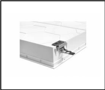
Plasterboard mounting brackets (4 pcs) (630033)