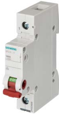
off switch 100A 1-pole, with red handle