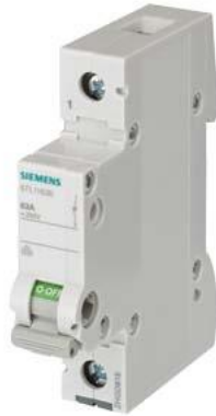
off switch 32A 1-pole