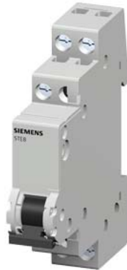
Two-way switch 20 A 1 CO