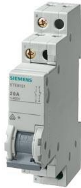
Two-way switch 20 A 3 NO 1 NC