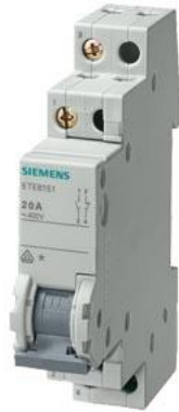
Two-way switch 20 A 2 NO 2 NC