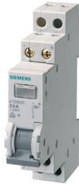
Monitoring switch 20 A 2 NO 1 lamp 230 V