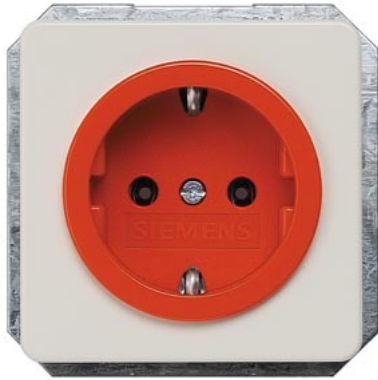
DELTA profil, titanium white SCHUKO socket outlet 10/16 A 250 V Orange bezel (ZSV) With screwless Connection terminals Cover plate 65x 65 mm