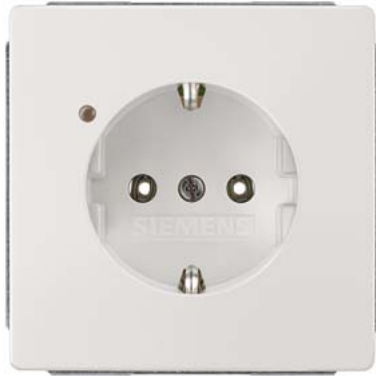
DELTA style, SCHUKO socket outlet 10/16 A 250 V Operating display orange cover plate 68 x 68 mm