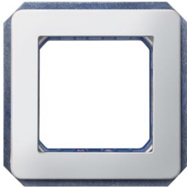
DELTA i-system aluminum-metallic Module rack, double incl. intermediate frame Screw mounting