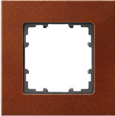
DELTA miro Frame 1-fold Authentic material wood Wood type maple red Dimensions 90x 90 mm