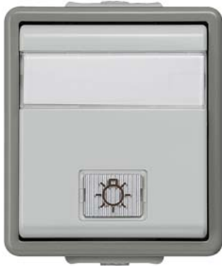
DELTA fläche IP44, AP Dark gray/light gray Two-way switch, 10A 250V with window, label, glow lamp 66x 75 mm