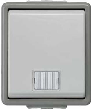
DELTA fläche IP44, AP Dark gray/light gray Monitoring switch OFF, 10A 250V with window, pilot lamp 66x 75 mm