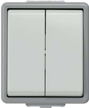
DELTA fläche IP44, AP Dark gray/light gray Two-circuit switch, 10A 250V 66x 75 mm