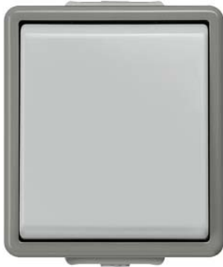
DELTA fläche IP44, AP Dark gray/light gray Universal switch switchover/OFF 10A 250V, 66x 75 mm