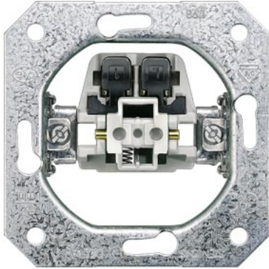
DELTA pushbutton device insert UP can be screwed, 1 NO 10 A 250 V