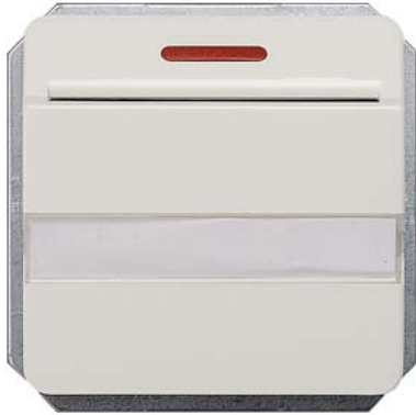
DELTA profil, titanium white HotelCard switch 1 change-over contact, illuminated