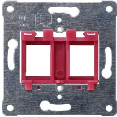
Support plate red insert for accommodating up to 2 modular jack connectors Screw mounting PEHA design. MJ1