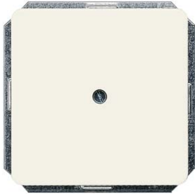
DELTA profil, silver blanking plate, 65x 65 mm