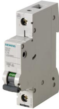
Miniature circuit breaker 230/400 V 6kA, 1-pole, B, 40 A