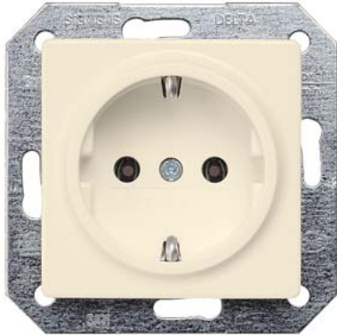
DELTA i-system electrical white SCHUKO socket outlet 10/16 A 250 V With screwless Connection terminals cover plate 55 x 55 mm