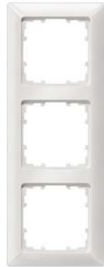
DELTA line, titanium white frame 3-fold, 222x 80 mm