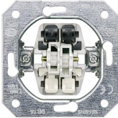
DELTA switch device insert FM, two-circuit switch 10 A 250 V