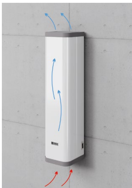
Airflow disinfection function

In ECO mode, the adjustable fan allows the airflow to be reduced to 110 m 3 /h, which makes the luminaire's operation quieter. Please note that in order to obtain a sufficiently high level of disinfection efficiency in this mode, the luminaire must operate at least two hours longer than in the standard mode