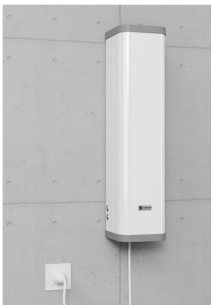
Version with cord (3 m)