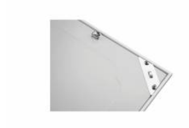
PLANO LED EVO 1