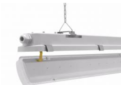
system zwieszania klosza / suspension system of the diffuser / hängende Diffusor