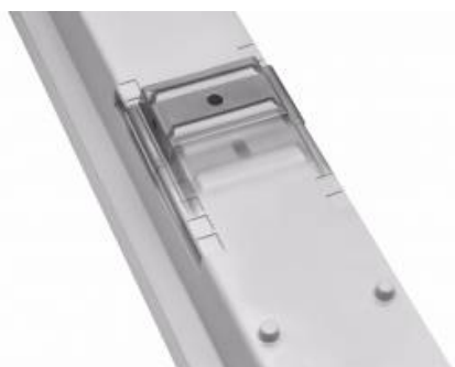
regulowane uchwyty / adjustable handles / einstellbare Halterungen