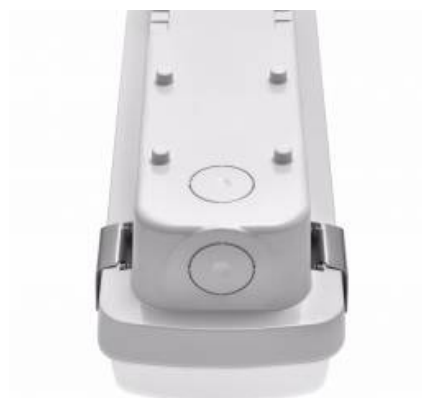
wybór miejsca zasilania / choosing a place of power supply / Stromversorgungsanschluss von mehreren Seite möglich