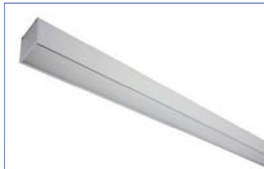
Decor 128 M82 PRZ