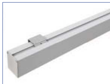
DECOR 128 M82 PAR