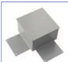
L-JOIN- "L" join element