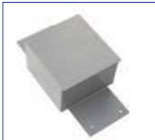
I-JOIN- "I" join element

Decor fittings have been designed for connection in modern lighting systems with wide choice of join accessories. Thanks to interesting design and wide choice of optics, they comply with the highest lighting standards and act as an interesting element of interior design.