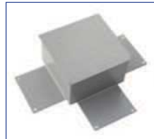
T-JOIN- "T" join element