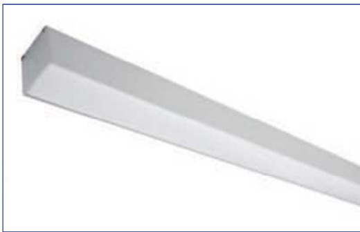
Decor 128 M82 OP