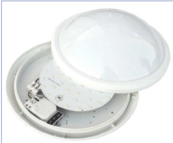
INDUS LED1X1050 B183 T840 MW