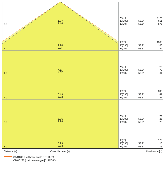
LDC typ cone