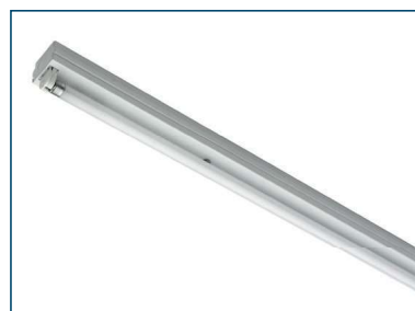
ALCOR 128 A55

Type: Slim T5 batten luminaire incorporating high frequency control gear, giving maximum efficiency and quality of light. Suitable for retail and commercial applications.