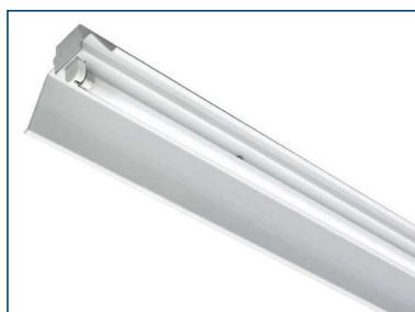
ALCOR 128 A56